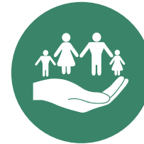
Caring for the abandoned