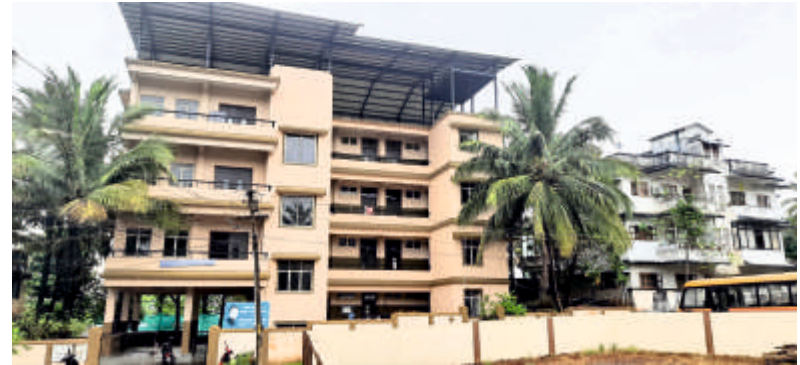
Don Bosco Primary School, Alto Dabolim

Thankfully, classes 7 to 10 were able to start in-School classes from November, much to the relief of all stakeholders!