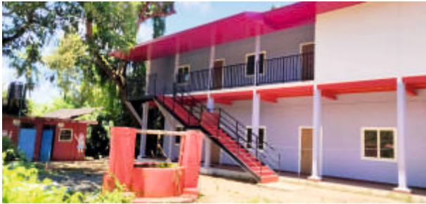
St. Dominic Savio High School Calangute

For the most part of 2021 the schools have been conducting virtual classes for all the students. It has been a difficult time for both, Teachers and children, who have faced multiple challenges in the delivery of and access to the study material!