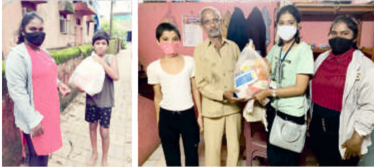
Covid Relief Aid

We have also provided Covid Relief to 216 families. Besides this, the team conducts Home study and Social investigation reports on the request of the Goa Child Welfare Committee .