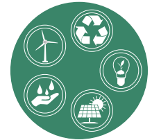
Care for the Environment