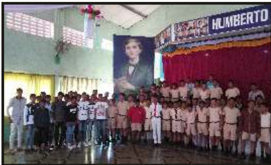
Don Bosco High School , Sulcorna