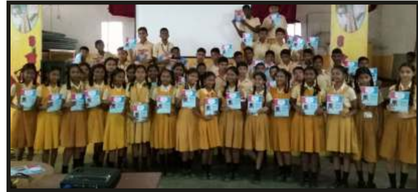
Our Lady of Succor High School , Nagoa