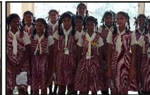
St. Xavier's High School , Velim