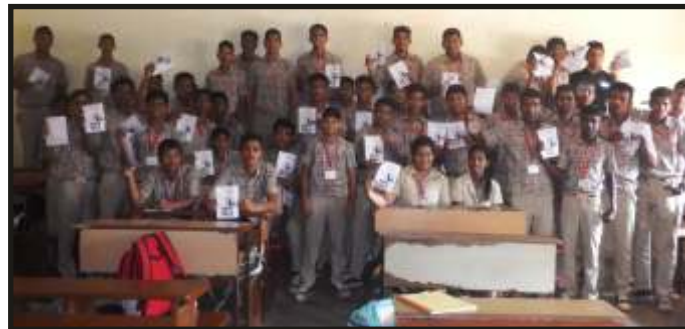
St. Mary's Junior College , Chinchinim