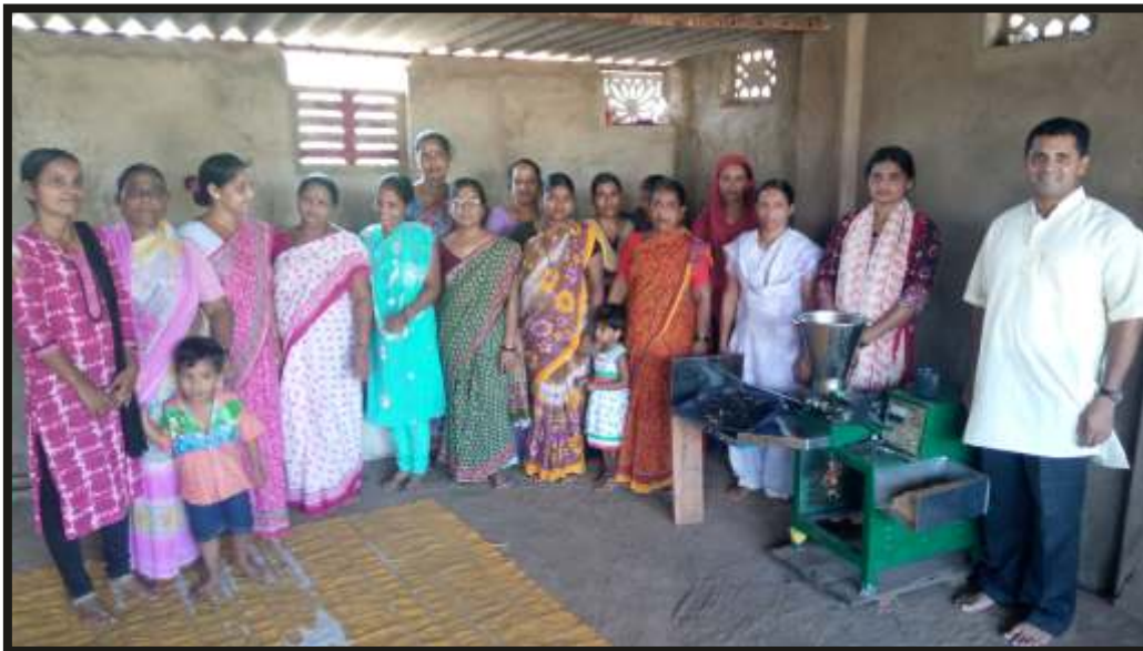
No. of Groups monitored by Don Bosco's Konkan Development Society